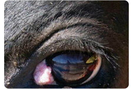
Early stages of cancer eye, as above, can easily be removed and are less likely to recur.